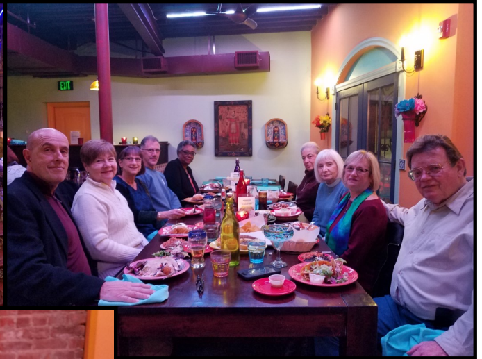
Mexican Radio restaurant