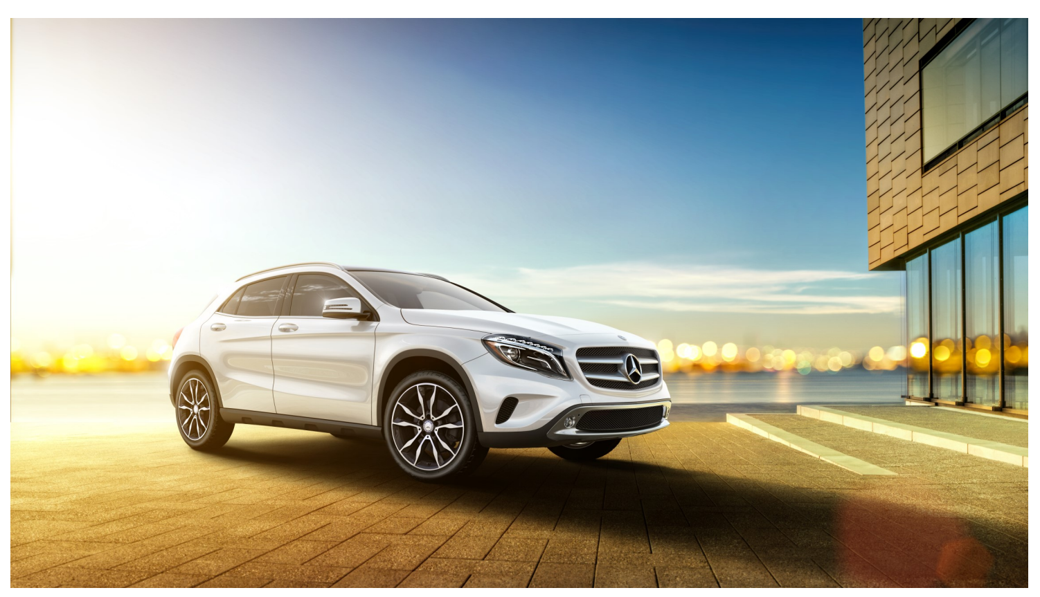
Keeler Motor Car Company