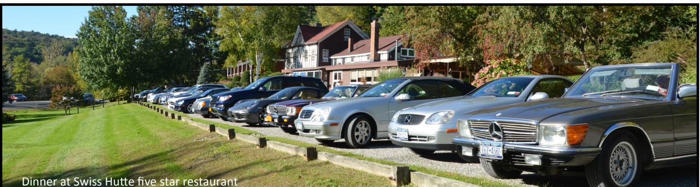
Dinner at Swiss Hutte five star restaurant