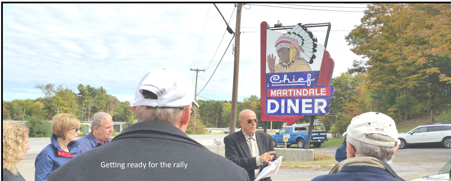
Getting ready for the rally