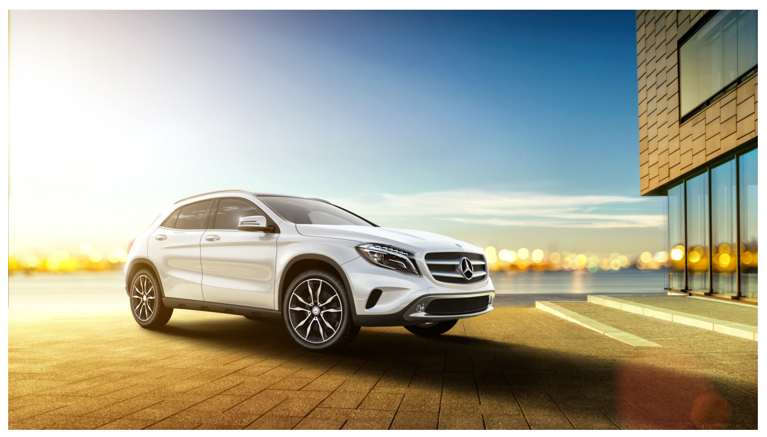
Keeler Motor Car Company